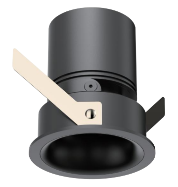
Curve baffle for soft and subtle beams