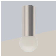
12W Ra98.3000K 120°